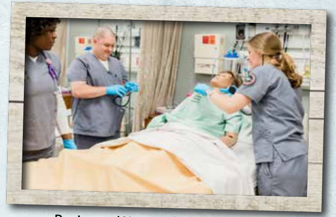
Registered Nursing (Technical Track)