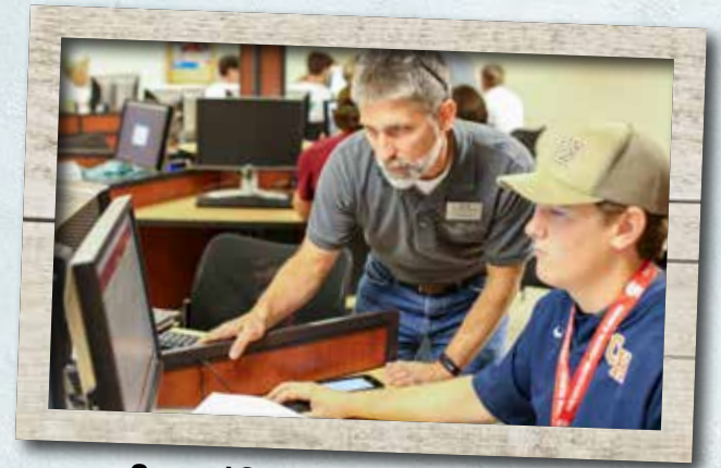
General Studies (Transfer Track) – Most popular program!