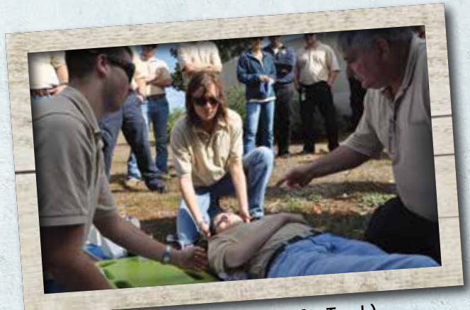
Health Science (Transfer Track)