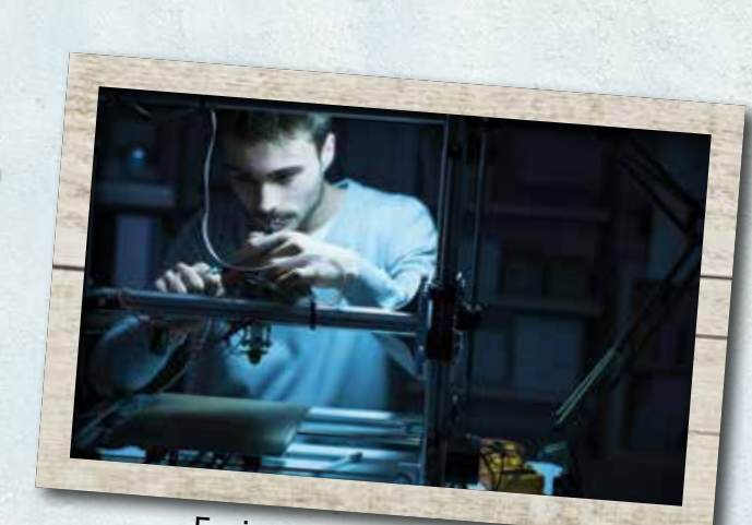
Engineering (Transfer Track)